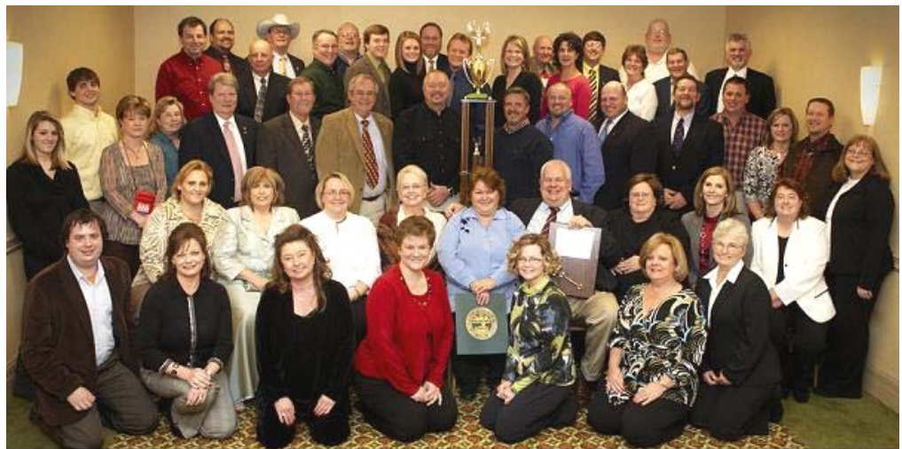
Lawrenceburg Rotarians, spouses, family, and friends celebrate their 2008 Champion of Champions Award.